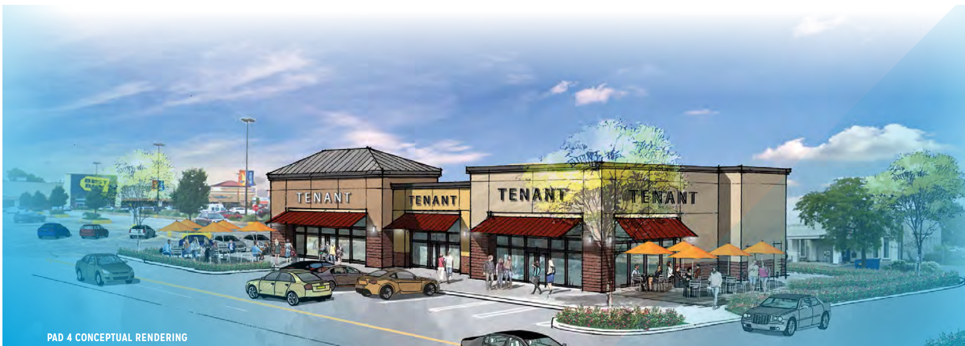
PAD 4 CONCEPTUAL RENDERING