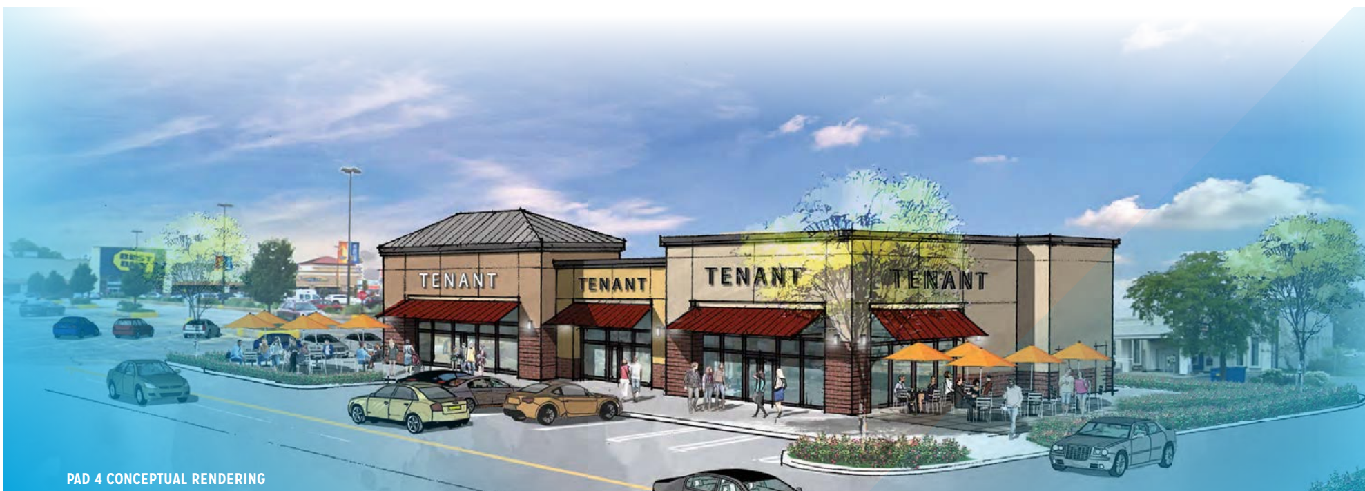
PAD 4 CONCEPTUAL RENDERING